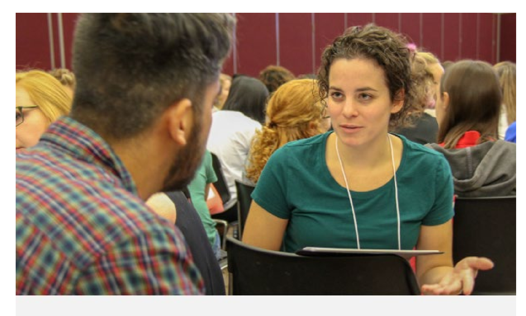
New TA Workshop